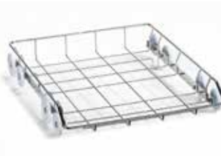
D-CS2 BASIC LOWER TROLLEY 45CM

Basic upper trolley with sprayer for the WD1160 and WD4060 model. It holds baskets and supports for surgical instrument treatment.