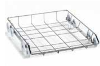
CS2 BASIC LOWER TROLLEY 60CM

Basic lower trolley for the WD2145 model. It holds baskets and supports for surgical instrument treatment.