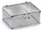
CSMICRO2 AND CSMICRO3 FINE-DRAWN MESH BASKET WITH COVER

Suitable for housing rotary cutters and small instruments.