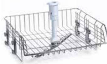
CS1-1 BASIC UPPER TROLLEY 60CM

Basic upper trolley with sprayer for the WD2145 model. It holds baskets and supports for surgical instrument treatment.