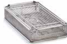
CSK1/6 BASKET WITH COVER

CSMICRO3 Dimensions lxdxh 280x168x45 mm.