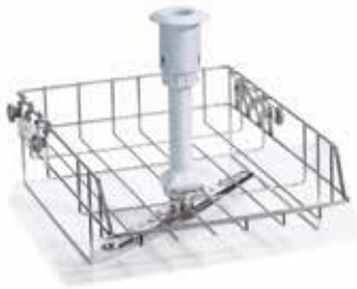
D-CS1 BASIC UPPER TROLLEY 45CM

Basic basket and support-holding trolleys for washing surgical instruments used in the operating room. They include incorporated sprayers (on the upper level) and a sprayer on the bottom of the machine (lower level). Made in stainless steel.