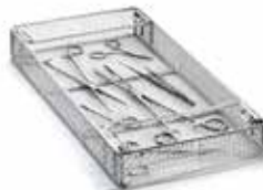
CSK2 INSTRUMENT BASKET WITH HANDLES

Suitable for dental instruments. 5x5 mm mesh.