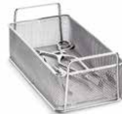
D-CM1 BASKET WITH HANDLES

Basket with handles, suitable for various instruments.