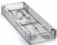
CSK1/3 INSTRUMENT BASKET WITH HANDLES

Suitable for dental instruments. 5x5 mm mesh.