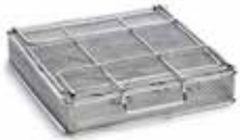
CSMICRO1 INSTRUMENT BASKET WITH HANDLES AND COVER

Suitable for dental instruments. 2x2 mm mesh.